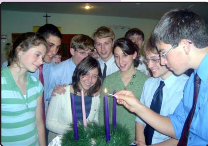
Students light the first Advent candle marking the beginning of the Holy Christmas season