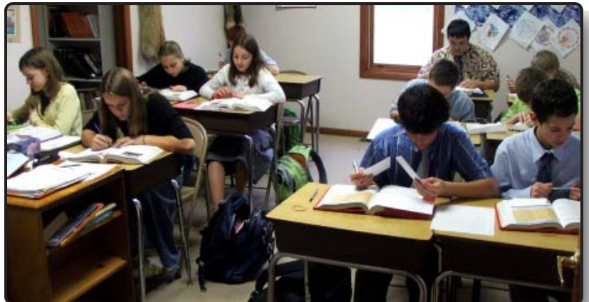
It's a good thing our students get along in such cramped quarters