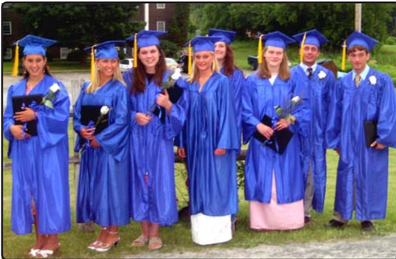
Congratulations, Class of 2006!

One of the greatest rewards of this apostolate we call Holy Cross Academy is welcoming new students and helping them develop into wonderful young adults. It is our purpose to send them into the world with the hope that they will do their part in restoring all things in Christ, but it is bittersweet to see them depart.