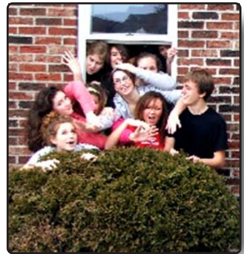
Our building runneth over!