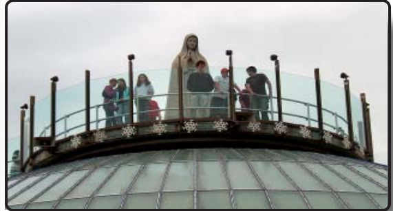
Students visited the Fatima shrine in Lewiston, NY on route to Niagara Falls