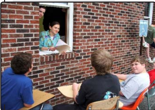
This is an inexpensive way to add classroom space, but it's difficult to see the blackboard