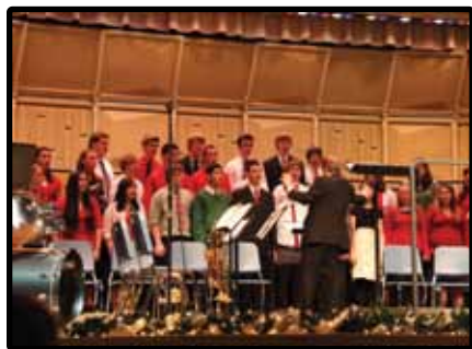
Students perform the piece "Mary Sat A-Rockin'" during the concert.

On December 5, the HCA Senior and Junior Choirs were special guests at the annual Oneida Area Civic Chorale Christmas Concert - "Joy to the World." Before a nearly sold-out audience at the Oneida High School auditorium, HCA impressed all with their performances of "Star-Child," "Mary Sat A-Rockin'," and "O Holy Night." The concert concluded with the students joining the Chorale to sing two pieces: "What a Wonderful Child," and "A Christmas Festival."