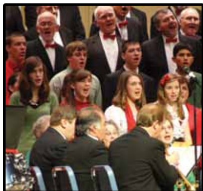
The two choirs combined for the concert's finale.