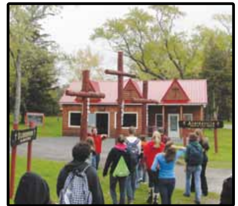
Students proceed on their walking pilgrimage toward Auriesville (above), arriving at the Shrine of North America Martyrs (below).