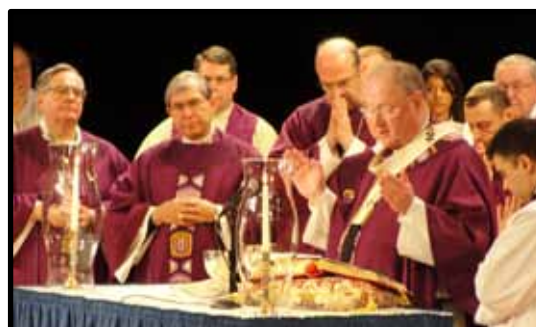
The senior class attended Public Policy Day in Albany on Tuesday, March 9. Organized by the New York Catholic Conference, the day-long event included a Mass offered by Archbishop Timothy Dolan.

HCA looks forward to taking part as an exhibitor at the first Syracuse Women's Conference this coming October.