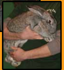
The Utica Zoo animals!