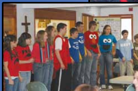
Students await the judges' decision for best-dressed twin on "Twin Day"