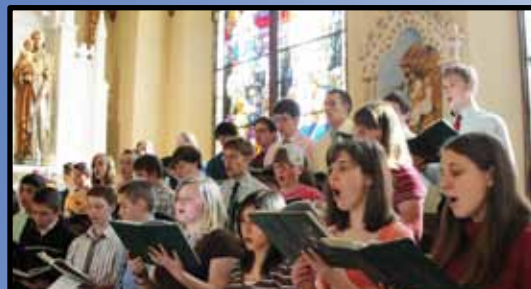
Below: Students sing at St. Patrick's Parish