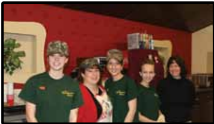
Student and parent volunteers helped make the show a great success!