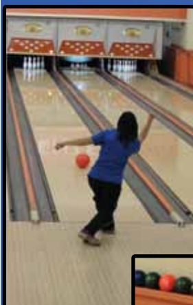
Annual Bowling Outing at Sherrill Community Activity Center