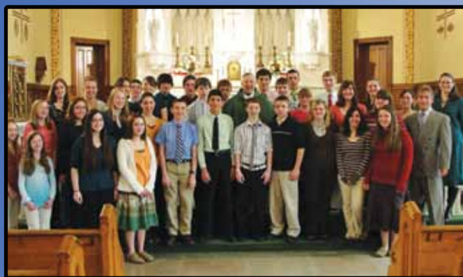
Above: Group photo at St. Patrick's Parish

Every day featured a special theme, as students participated in School Spirit Day, Twin Day, and Crazy Hats or Socks Day. The week culminated with a re-consecration of the school to the Sacred Heart of Jesus, the awarding of Honor Roll certificates, and the display of students' poems and essays explaining what being a Holy Cross student means to them. All in all, it was a fun week of both sharing and enjoying the gift of education and friendship!