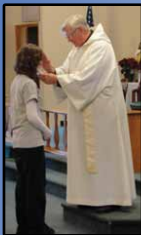
Blessing of throats on the feast of St. Blaise

I do not stand lifeless I'm not merely brick walls There is a spirit within me Joy flows through my halls.