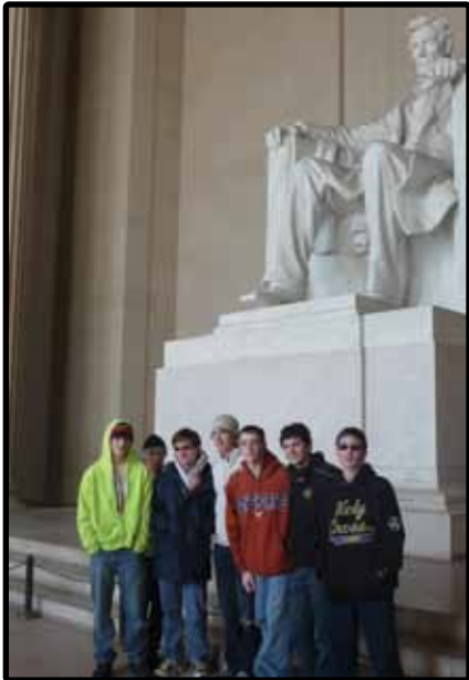
The Lincoln Memorial