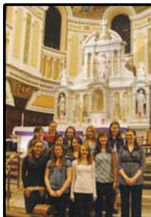
The Women's Ensemble stands before the main altar at St. Joseph/St. Patrick parish.

On March 11, the newly-formed HCA Women's Ensemble made an appearance at St. Joseph/St. Patrick parish in Utica. They were invited by members of the Ancient Order of Hibernians, a Catholic, Irish-American organization, to sing preludes prior to their annual St. Patrick's Day Mass.