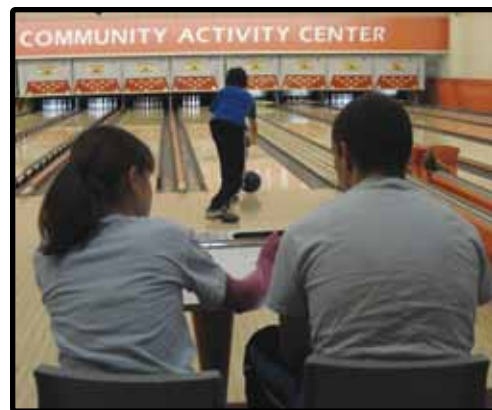
Let's put the "fun" back in fundraising: Students participate in "Bowl-a-Thon" to raise money for their bus trip and lodging at the 2011 March for Life.

The PTSC is comprised of four elected officers – President, Vice-President, Secretary, and Treasurer – who focus on planning all the school's fundraising activities. They ensure each event has a chairperson or persons, and that every junior and senior high class lends a hand during the year. They also run meetings on a regular basis to evaluate past fundraisers and consider new fundraising initiatives.