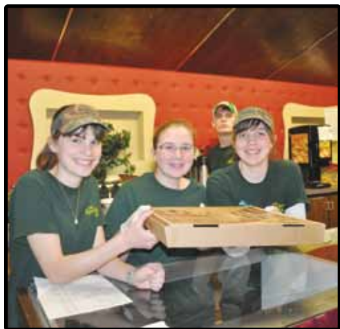
Students work the concession stand at the 2011 CNY Sportsman Show. The generosity of our volunteers is the key to every fundraiser's success.

Since the first students enrolled in 1997, HCA has exercised great fiscal prudence and careful stewardship of its budget to maintain an education that is both excellent and affordable. Revenue from tuition only covers some operating expenses, so donations to our Annual Fund and profits from our fundraising events are the chief tools to make up the remaining balance. Fundraising events are essential to the Academy's sustenance and growth, as they generate a 15% average of our annual revenue.