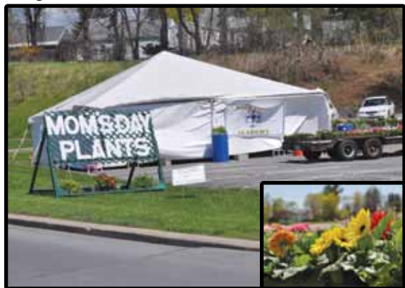
2011 Mother's Day Plant Sale at the Sangertown Square Mall, New Hartford.

The PTSC has been busy at work throughout the late winter and spring months, when several major annual fundraising events take place: The CNY Sportsman Show (February); Fudge Sale (April); Mother's Day Plant Sale (May); and the HCA Dinner Dance (May). Each one relies on hard-working parents and students who generously volunteer their time and talents!